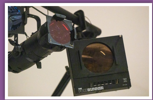
The light system uses lights for which replacement parts are no longer made and are hard to come by.