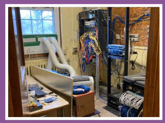
Before: Union Springs MS/HS IDF-4 is a dedicated space that was poorly configured. Floor AC units blocked rack access and cables entered the ceiling unsupported by conduit nor protected by firestop.