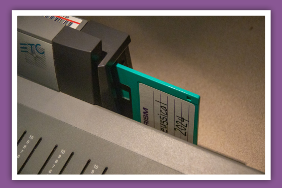
The sound system currently is run on a computer that utilizes a floppy disk and is in need of constant repairs.