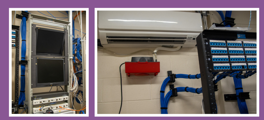
After: Our re-cabling, as well as our new mounted cooling enhancement, have truly made a difference in the quality of our network and the stability of our internet.