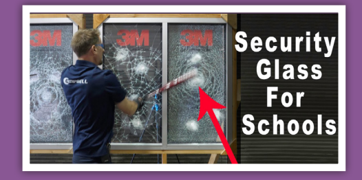
Window Fortification - the installation of window film to hinder intruder entry.