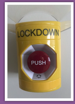
Providing lock-down alarms that connect with emergency responders.